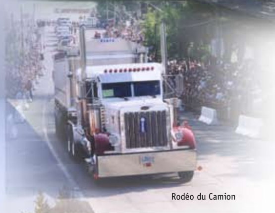
Rodéo du Camion