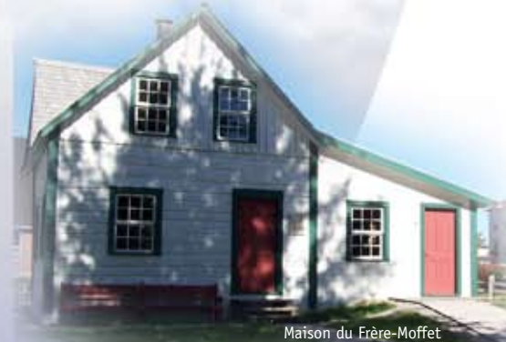
Maison du Frère-Moffet

Témiscamingue’s gentle landscape conceals under its green cover and sparkling water, the vitality and willingness of entrepreneurs who energize the tourism industry.