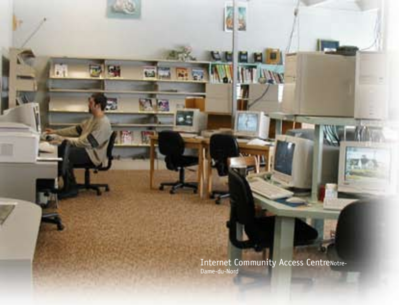
Internet Community Access Centre Notre-Dame-du-Nord