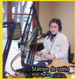
Station de radio Ville-Marie