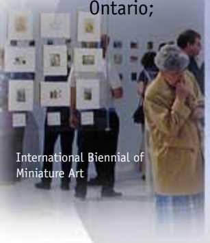
International Biennial of Miniature Art