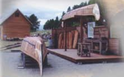
Canada's Fort Témiscamingue historic site